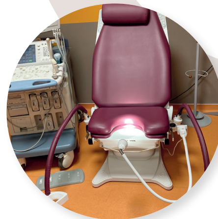
Carla focus 100 contactless switch