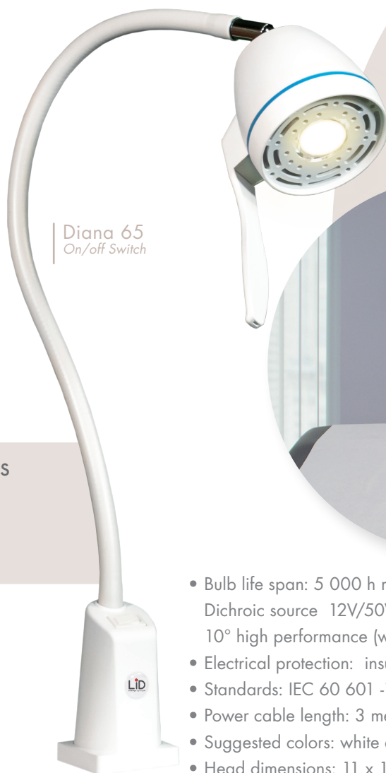
Diana 65 On/off Switch