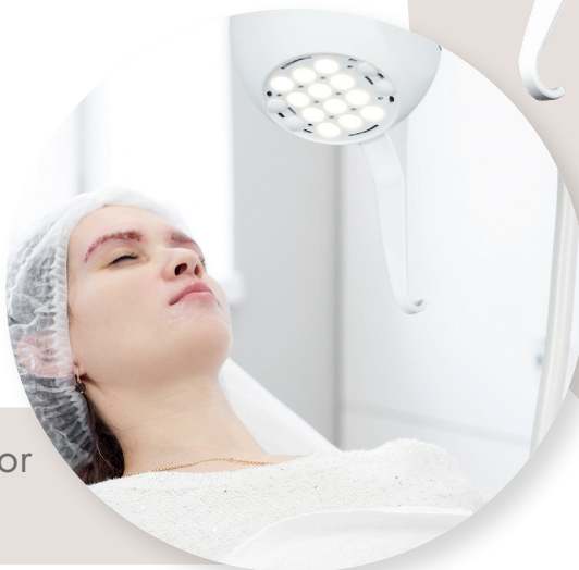
Bella contactless switch

Ideal for dermatology, and minor or cosmetic surgery